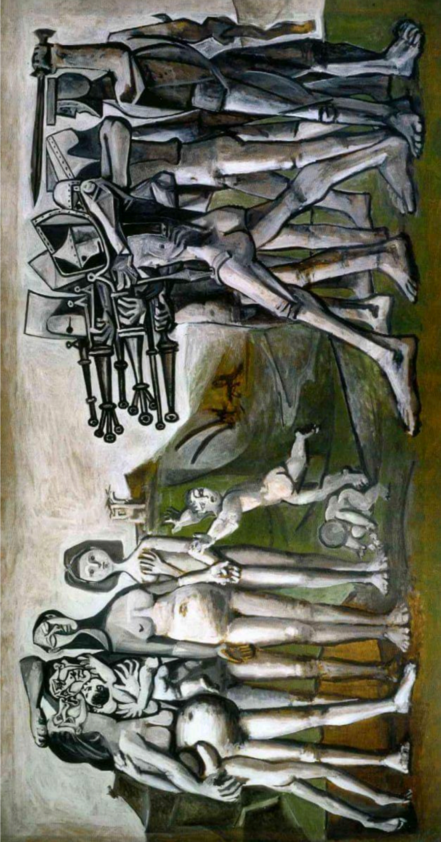
Picasso, Massacre in Korea.